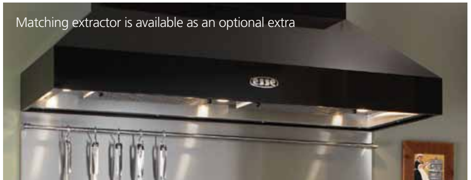
Matching extractor is available as an optional extra